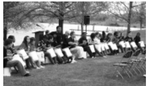
Drummers with Attitude percussionists