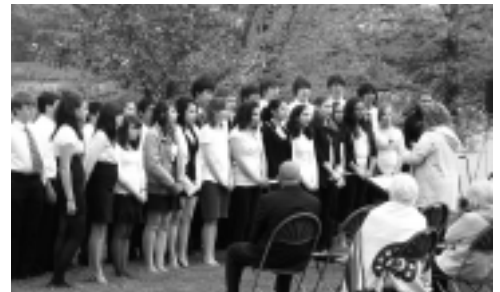
Lenape Middle School Chamber Ensemble